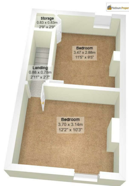
First Floor All measurements are approximate and for display purposes only

Please contact our Stoke-on-Trent Office on 01782 392211 if you wish to arrange a viewing appointment for this property or require further information.