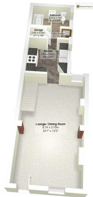
Ground Floor All measurements are approximate and for display purposes only